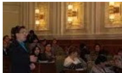
Q&A at the final project seminar