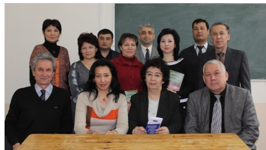
Seminar at TUIT ILS department

▪ Seminar on “Copyright in the learning programs of library faculties” held at TUIT Department of Information and Library Systems (ILS) to discuss introducing the teaching of copyright to librarians, attended by 12 lecturers and masters students who offered their recommendations to the project team. As a result, two new topics – “Copyright for electronic publications” and “Licensing” – are being piloted in the masters course “World Information Resources”.