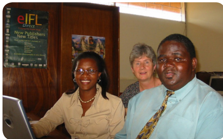
Ten years ago MALICO members examine electronic information resources at Bunda Library.

With higher bandwidth, more libraries, scholars are now able to access and benefit from e-resources.