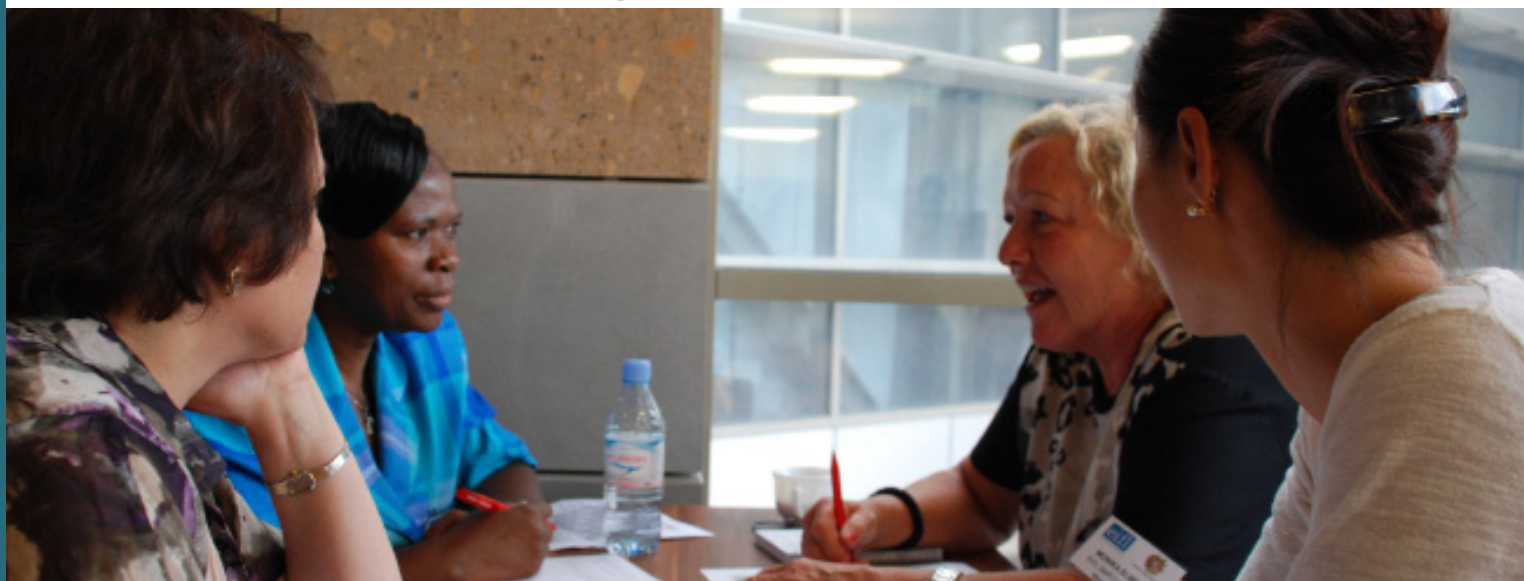
EIFL library consortia members (left) discuss issues and share knowledge with EIFL consortium management staff (right) at the 2012 EIFL General Assembly.